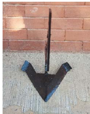
Sweep Type weeding tools