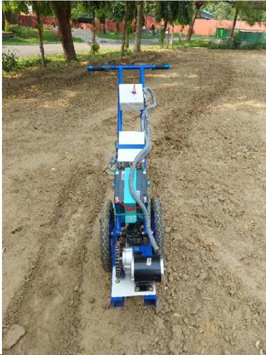
Pusa Mini e-Prime Mover