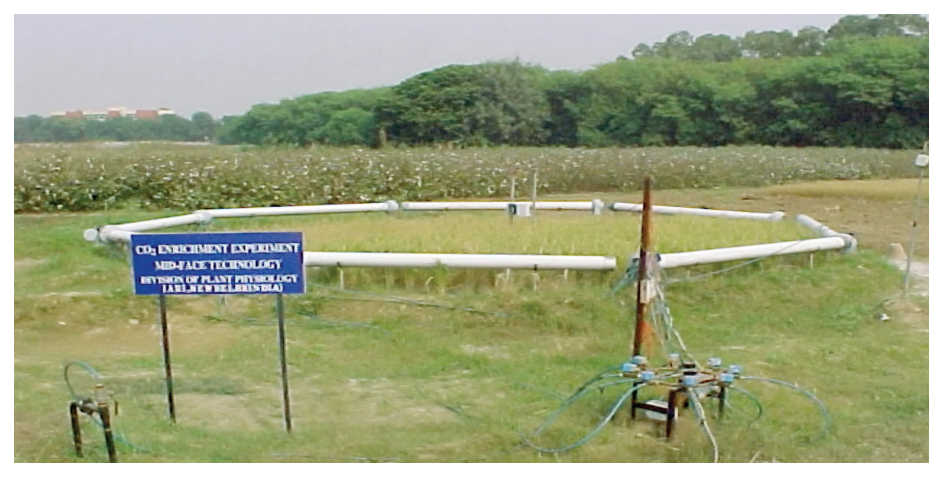
Free Air CO2 Enrichment (FACE) technology

IARI was identified as the main global centre for CO_2 enrichment research on crops in South Asian region. Open Top Chamber CO_2 enrichment technology was designed and made available to Bangladesh, Nepal, Pakistan and Sri Lanka. A mid FACE facility was established in IARI, the first of its kind in South Asian region. Scientists, students, and research scholars from South Asian countries and Indian scientific institutions were trained for CO_2 enrichment resource & technologies from crops.