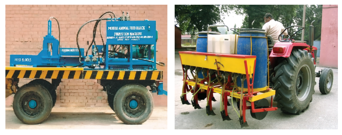
Mobile unit of animal feed block formation machine

A solar dehydrator for fruits and vegetables was developed. The tunnel type dryer is 1m wide and 2 m long. It has a movable truck with 20 trays on which material is loaded for drying. Studies on dehydration of cauliflower (Pusa Snowball) and three varieties of onion (EG, Pusa white round and Pusa white flat) revealed that the product pretreated with KMS and dehydrated in the newly developed dehydrator could be safely stored for six months in the laminated foil.