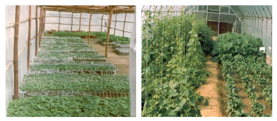
Low cost poly-house for growing off-season vegetables

The Division has developed six production technologies, viz., raising off-season nursery of cucurbitaceous vegetables, easy and efficient method of hybrid seed production of cucurbits, cultivation of high value vegetables in low-cost poly-house, technology for successful storage of Broccoli, ratooning of brinjal, and cultivation of cauliflower in different seasons.