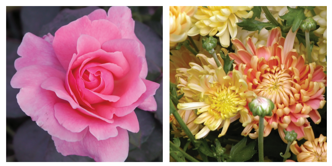
Rose variety- Pusa Garima

In the case of Chrysanthemum, potential mutants were noticed in one of the promising standard cultivars Thai Chen Queen, and two of the spray cultivars, Ajay and PC 10. Significant chimeras of variable colours were noticed at 1.0 and 2.0 Kr dose. Very useful variants having different flower shape, floret shape, leaf shape and sizes were noticed.