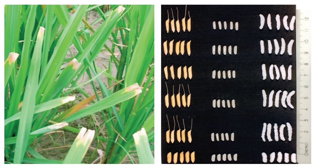
Typical resistance reaction of Pusa Basmati 1 to the bacterial blight (BB)disease inoculums in the field

paddy price of this variety in the mandi was Rs. 30,000/t, bringing a gross return of Rs 1,50,000/ha to farmers as against Rs 45,000/ha from cultivation of Taraori Basmati and Rs. 60,000/ha from Pusa Basmati 1.