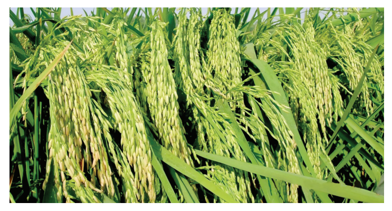
Pusa RH 10 - First fine grain aromatic rice hybrid

The Pusa rice varieties cover more than 60% of rice grown in Punjab, Haryana, Uttaranchal and western Uttar Pradesh. Of the basmati varieties covering the area, more than 80% varieties were from the Institute making up a volume of more than 90% exported from India. Hybrid rice 'PRH 10', the first basmati quality hybrid in the world, significantly outfields 'Pusa Basmati 1' and has been taken up by a large number of seed companies.