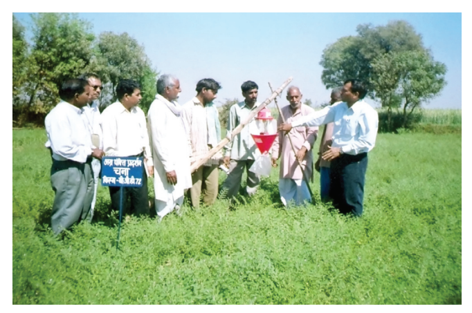
A subject matter specialist (plant protection) demonstrating the use of light trap in checking the insect population in gram crop at Teekli village, Gurgaon district, Haryana