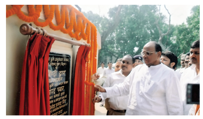
Shri Sharad Pawar, Hon'ble Union Minister of Agriculture, Consumer Affairs, and Food and Public Distribution inaugurating the Centenary Gate at IARI Regional Station, Pusa (Bihar)

The Regional Station, Pusa laid major emphasis on wheat improvement. Promising wheat cultures with diverse genetic background have been developed. Foliar blight resistant/tolerant lines HP 1882 and HP 1890 have been identified. Pusa (B) 0039 and Pusa (B) 0038 have been found superior in yield and resistance to Alternaria sp and